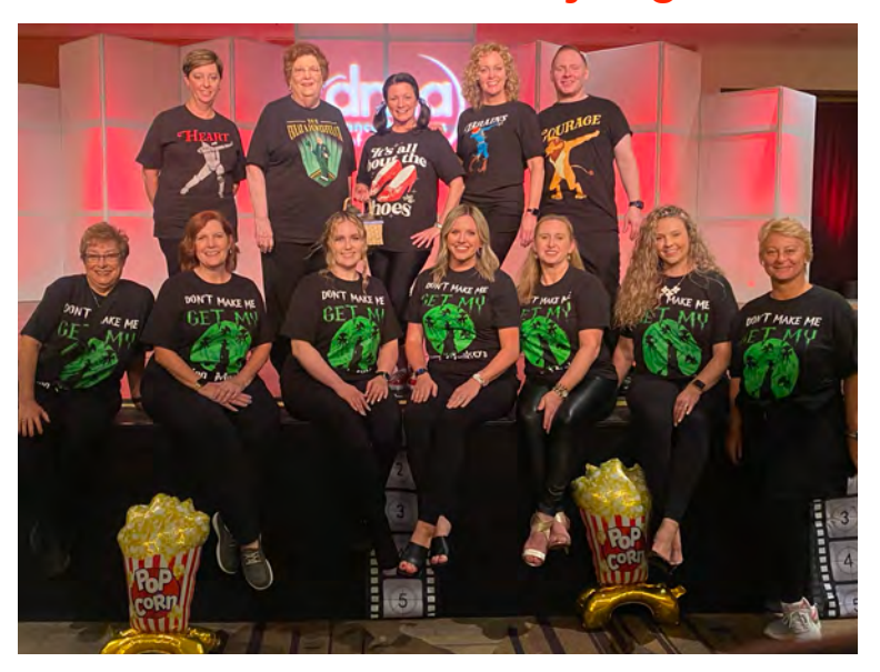
Pictured above: The National Executive Committee

Welcome to Dance Masters of America 139th National Convention! An entire year has passed since we have crossed paths but it never seems to feel like a year. We are four days into our time in Anaheim and we have already completed our Ballet & Jazz Intensives and the preliminary rounds for our Solo Title Competitions! Our convention classes are underway and we are so excited for our dancers to take from the incredible list of master teachers.